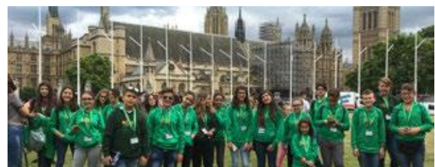
INCLUDED Full-Day Trip – London