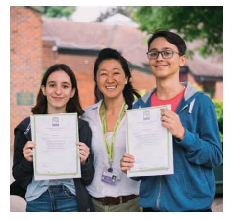
Students and Director of Studies with certificates