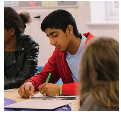
Students in General English class